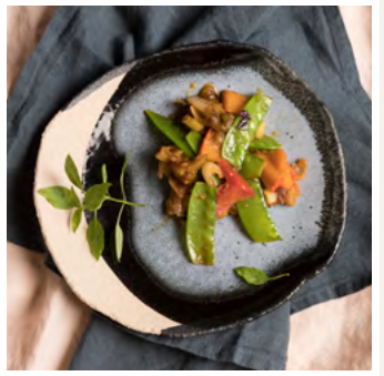
KARINE & JEFF Ready-cooked meals