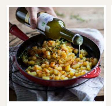
BIO PLANÈTE Organic Oils